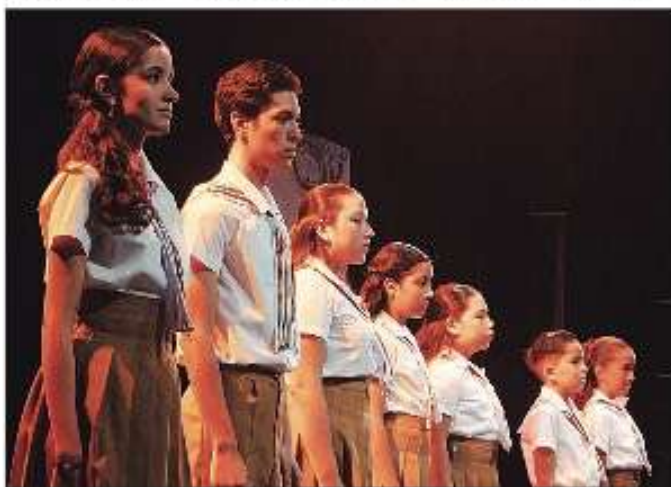
See "The Sound of Music" in August.

As relevant today as it was upon its 1965 film debut, The Sound of Music continues to